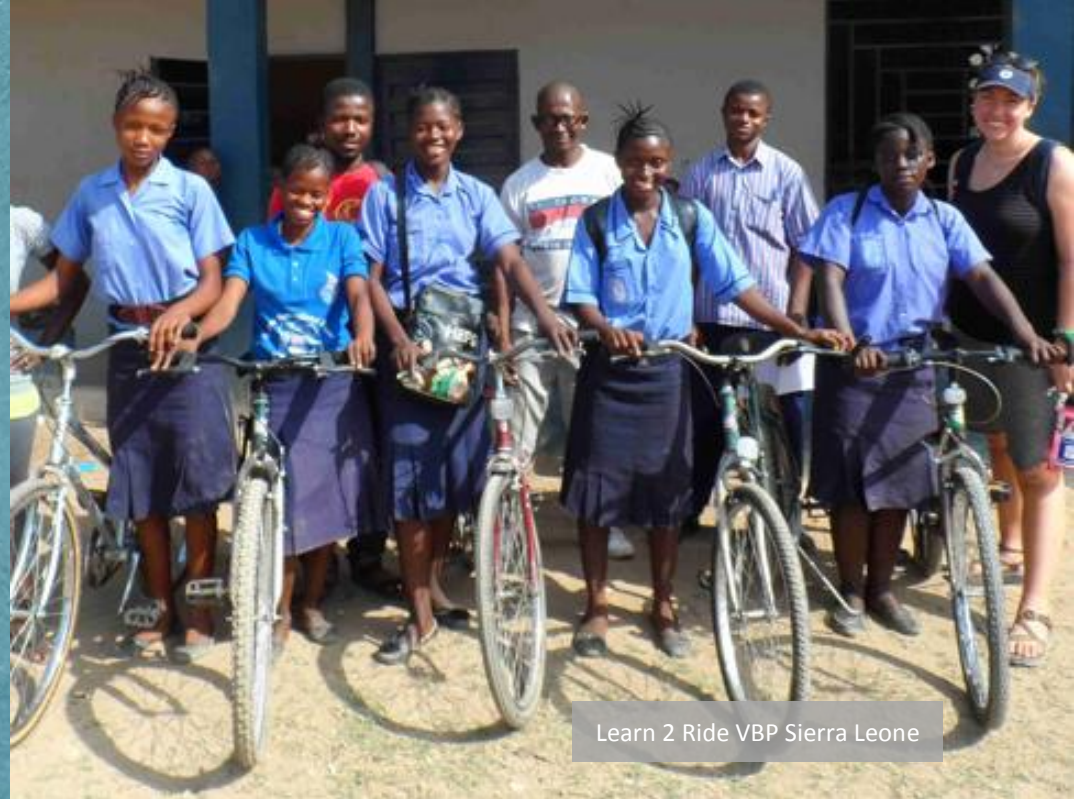
Learn 2 Ride VBP Sierra Leone

We are committed to supporting education projects and added two in 2013. ChildFund International is supplying bikes to students in Mozambique and we also sent a small shipment of bikes to Cameroon for students in school.