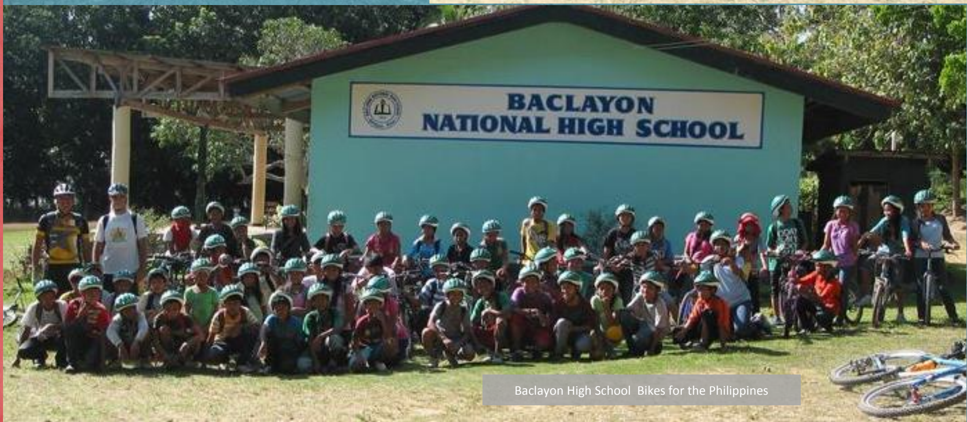
Baclayon High School Bikes for the Philippines