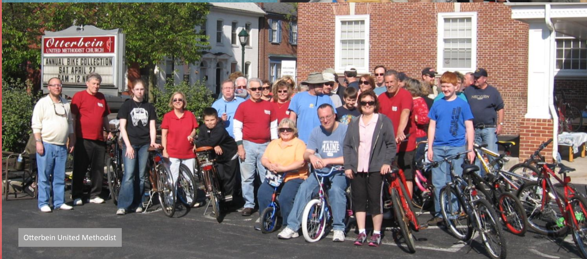
Otterbein United Methodist