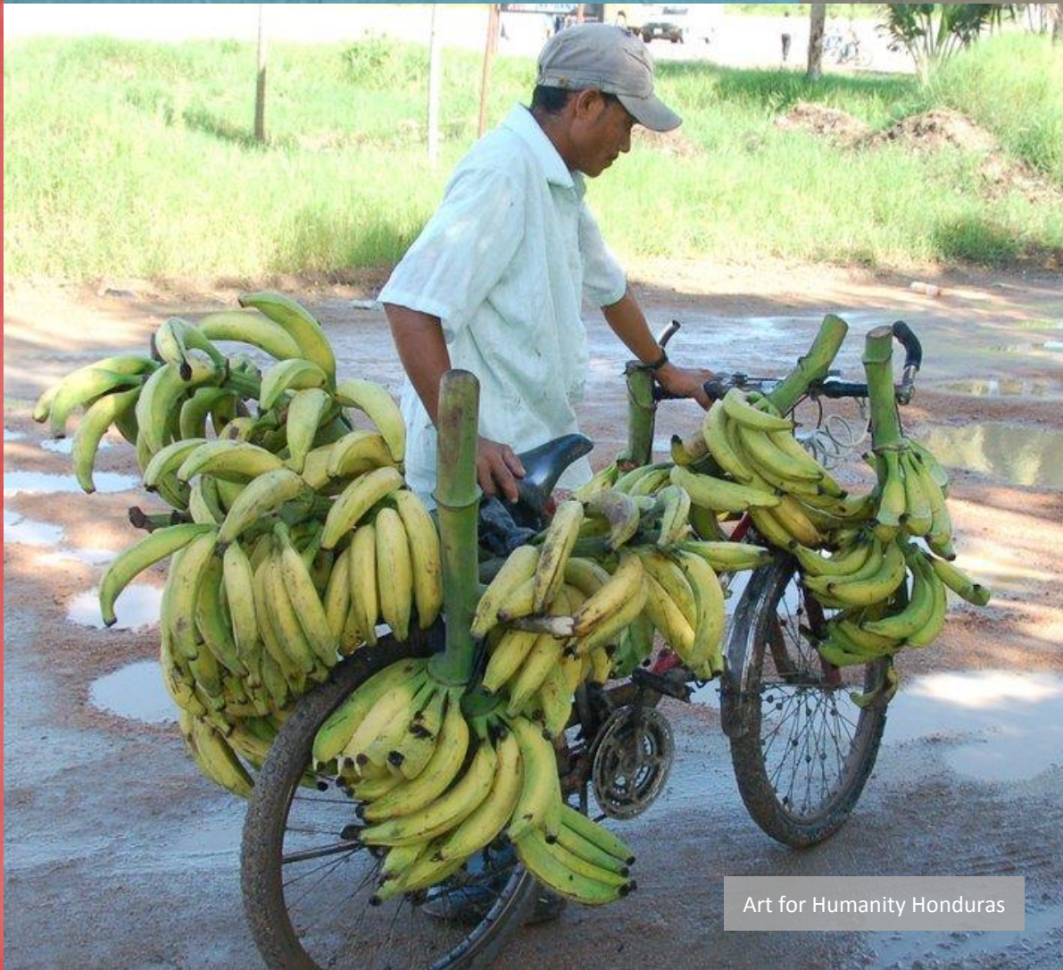
Art for Humanity Honduras