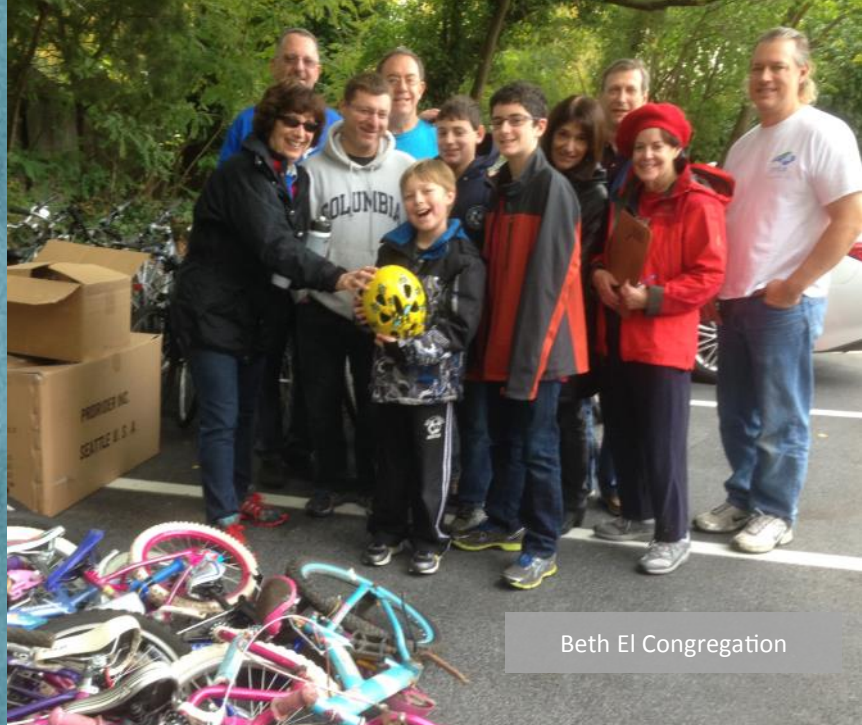
Beth El Congregation