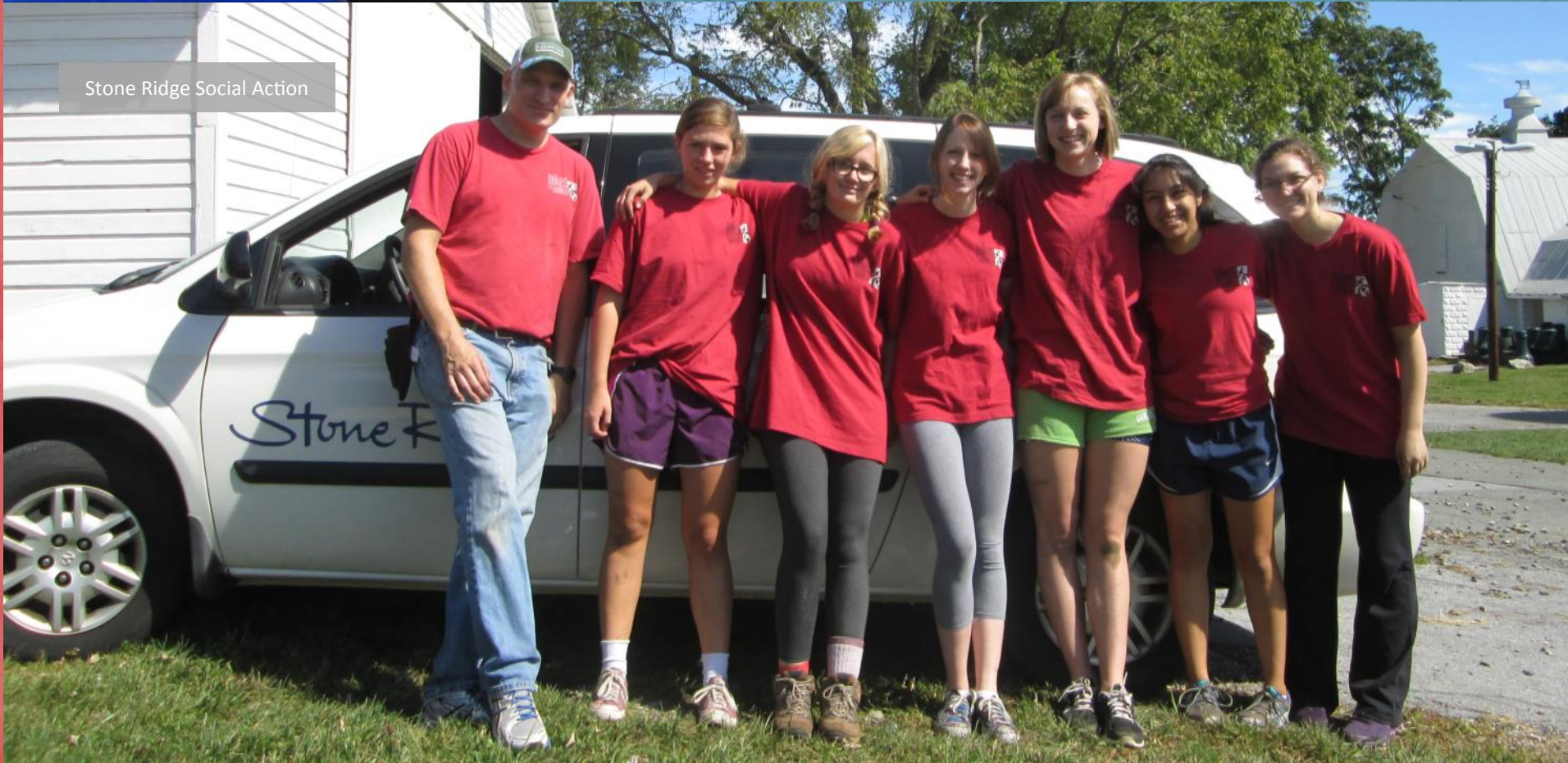
Stone Ridge Social Action