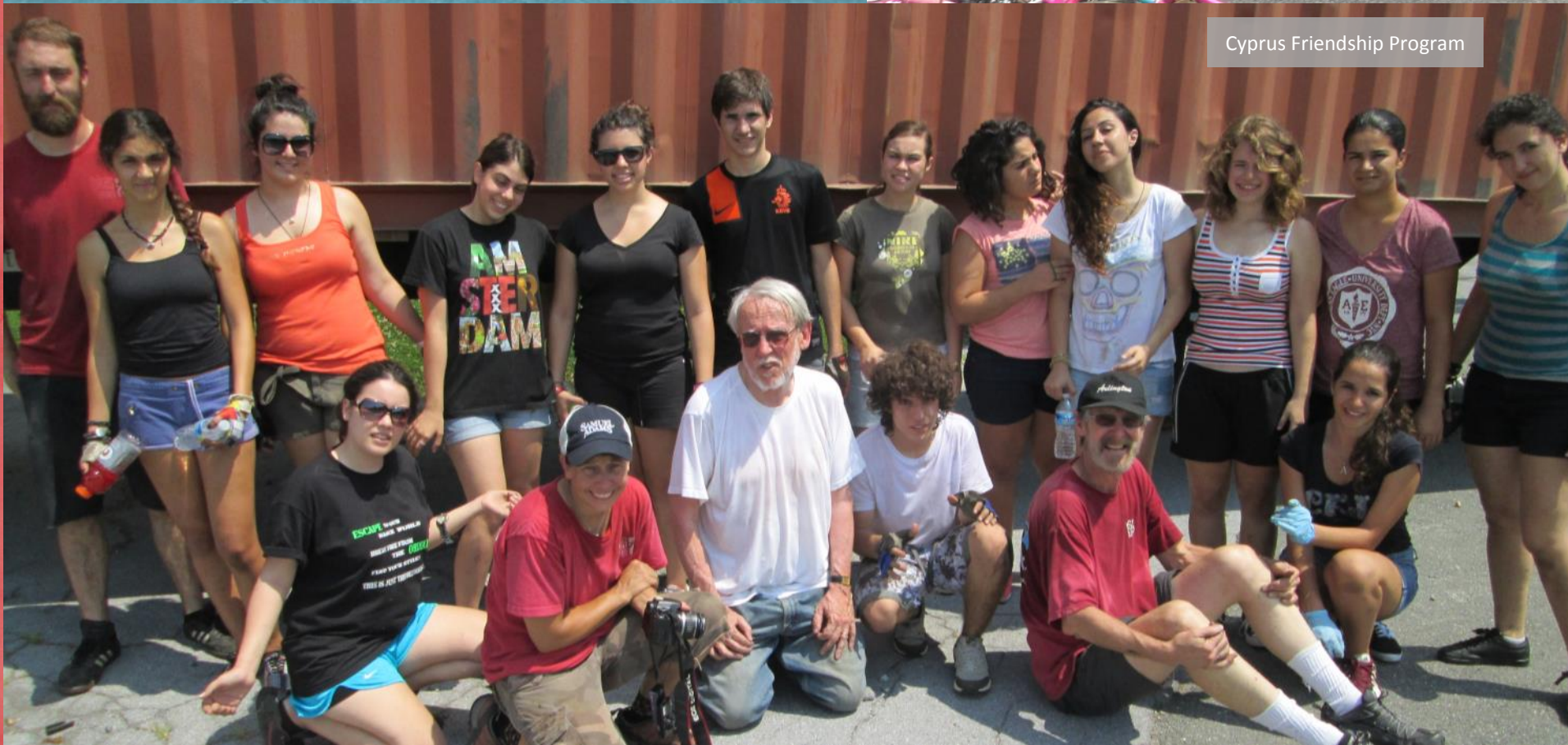
Cyprus Friendship Program