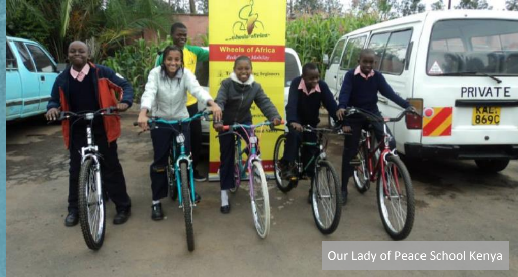
Our Lady of Peace School Kenya

We are also awaiting the arrival of two containers to two other new partners. ChildFund International is a new education program for BfW in Mozambique. And Fundacion Adelante in Honduras is a micro-finance project we hope to continue supporting. Follow us online for updates and photos from these pilot projects throughout the next year.