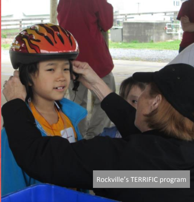
Rockville's TERRIFIC program

Bikes for the World's global impact might be greatest right here at home through the rewarding community service projects we provide. We help ordinary people do extraordinary things, empowering them to reach into their communities and extend a helping hand across the globe.