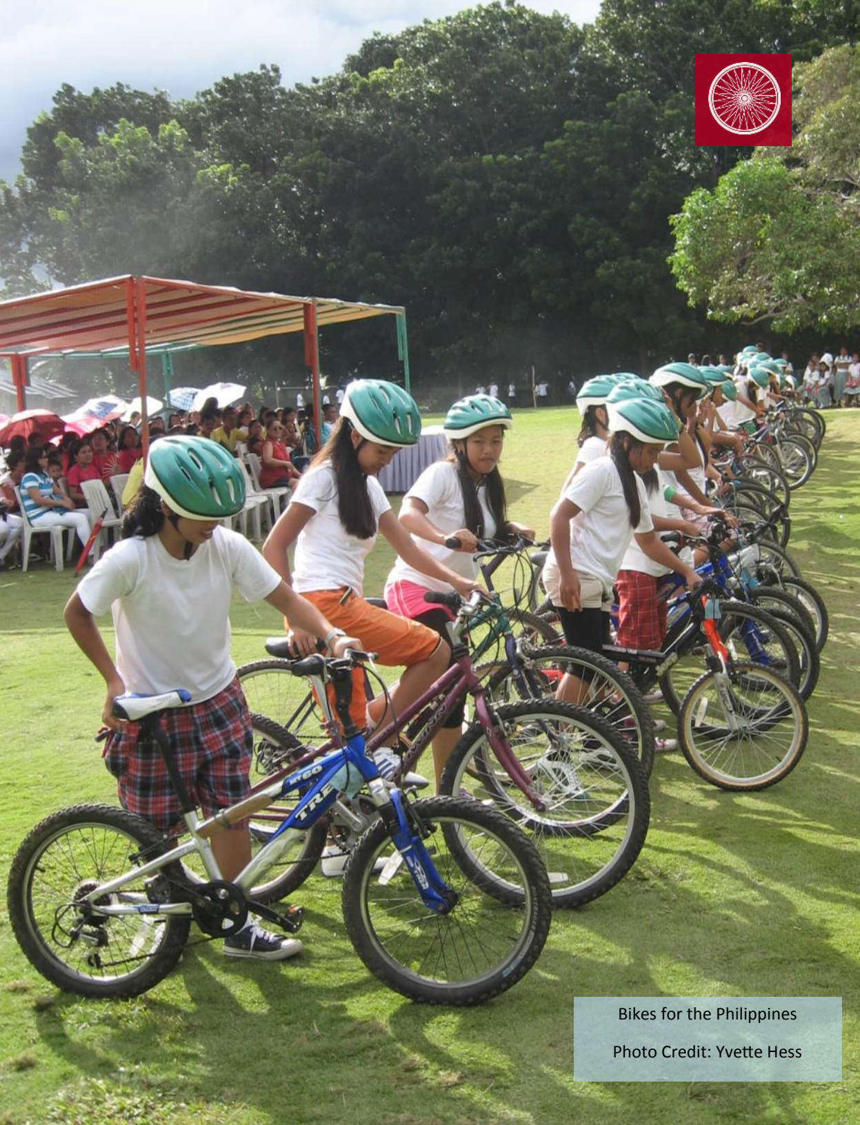
Bikes for the Philippines

Cycling, as transportation, exercise, and a vehicle for social change, has taken a major role in the school system as well as the entire community. Students are taught to ride, how to care for their bikes, and overall bike safety. The bicycle has brought a new confidence and energy level to our beneficiaries. They have not only received a way to stay in school but also hopes and dreams for their futures, where there once were none.