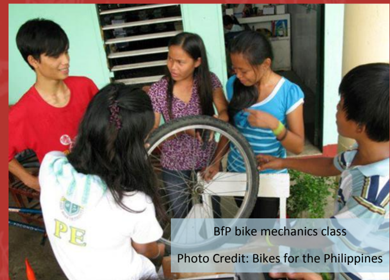
BfP bike mechanics class