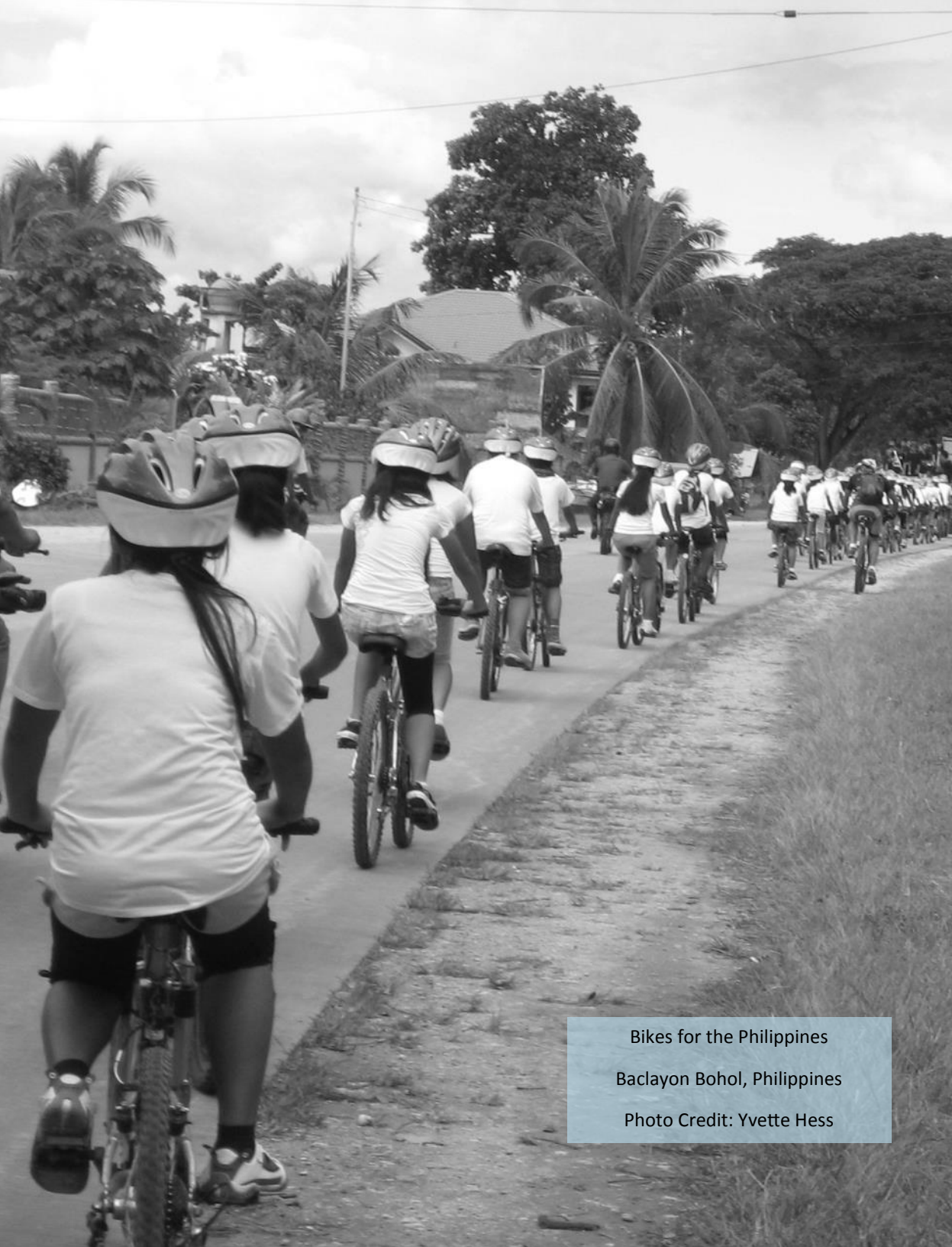
Bikes for the Philippines Baclayon Bohol, Philippines