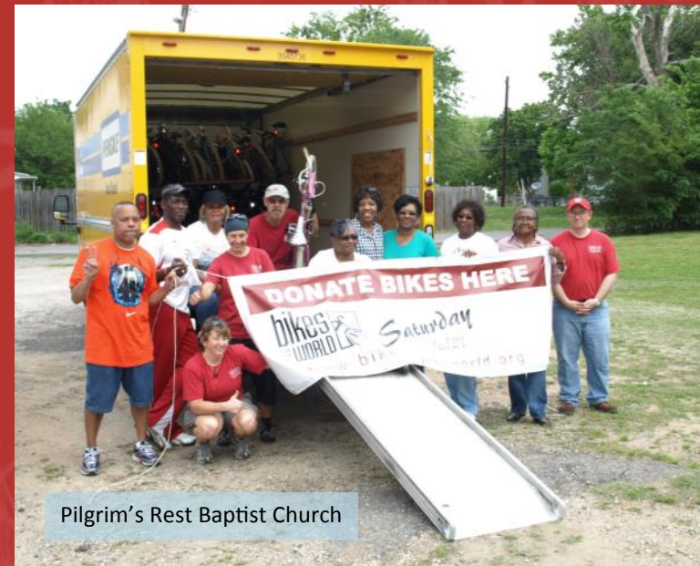
Pilgrim's Rest Baptist Church